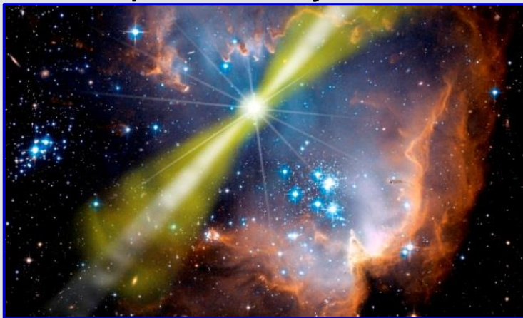
Gamma Ray Burst