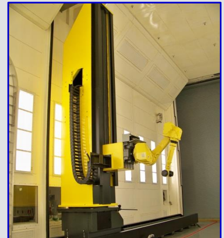
Thermal Protection System Spray Booth