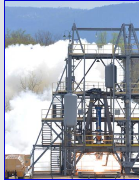
24-inch Solid Rocket Motor Test