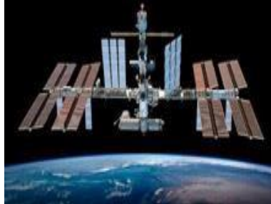
International Space Station