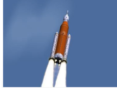
Space Launch System